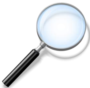
Magnifying glass: wikimedia

Copy and paste ISBNs into a search engine: