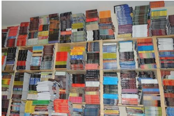
Addis Ababa Bookshop

The shops listed at right sold our 1 st edition. Enquire there about the 2 nd edition of Lucy's People .