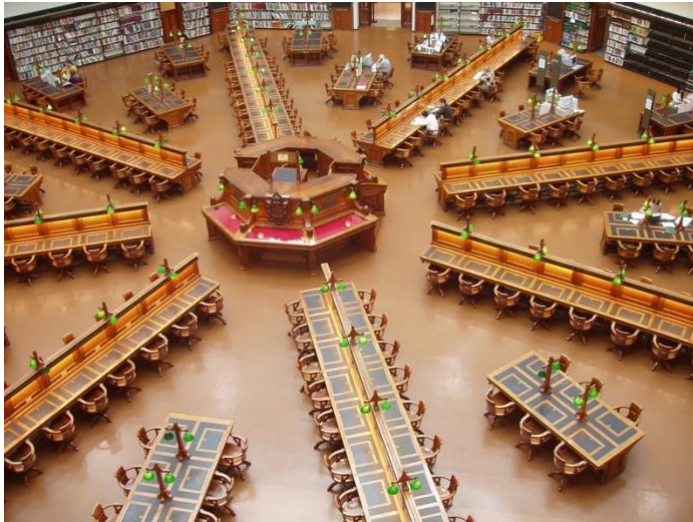
State Library Reading Room, Melbourne, Australia

Ask your local library or favourite book shop to stock our paperback.